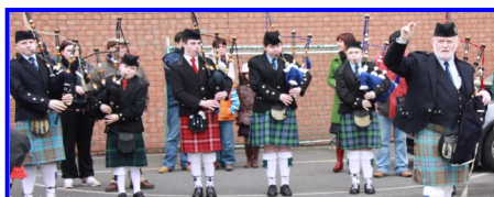
Final practice in Dublin, before the parade