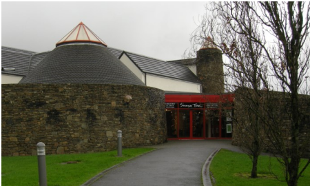
Siamsa Tire, Tralee, Co Kerry

In planning for the Siamsa Tire Concert, it was uppermost in our minds to keep costs to the minimum.