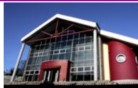
The theatre has a 'modernist' design approach, the facilities are similar to those of Siamsa Tíre and possibly much better.