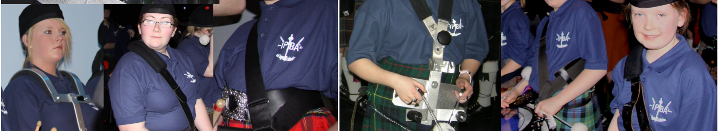
Someone call for the drummers ?'cause they were just chillin