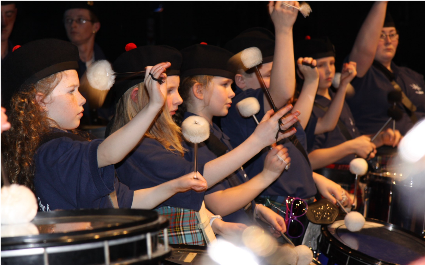
tenor drummers in action

This newsletter is an attempt at recording and promoting the NYPB and most importantly entertaining all its members. While this first issue is primarily photographic in nature and undertaken by people 'behind the scene', we would, in the future, hope to incorporate, articles, photographs, comments (good, bad or indifferent) from YOU the members of the NYPB. Each and everyone of you are probably