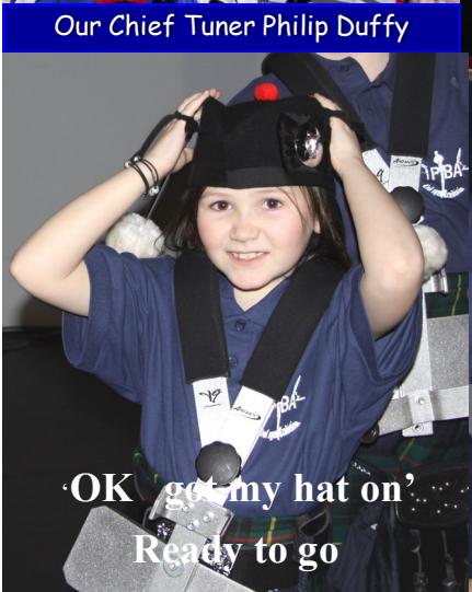
'OK got my hat on' Ready to go