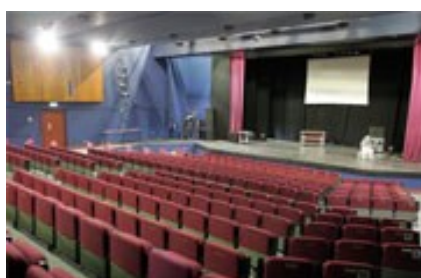
Auditorium seating in the Grianán Theatre, Letterkenny. There is accommodation for 383 people seated.

The next concert of the NYPB is scheduled for the Grianán Theatre, Letterkenny, Co Donegal.