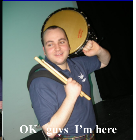
OK guys I'm here