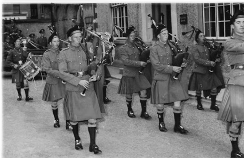
Above Photographs: An Céad Cathalán (1 st Bn Galway) Pipe Band