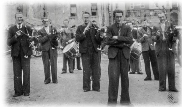
Laune Pipers', Killorglin