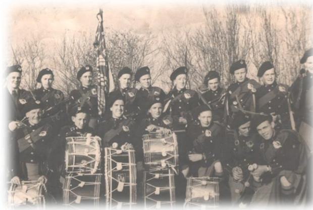
Carlow Pipe Band