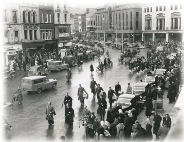
Funeral cortege of Tadhg Crowley 1952.

Sadly Tadhg Crowley passed away at the age of 52.