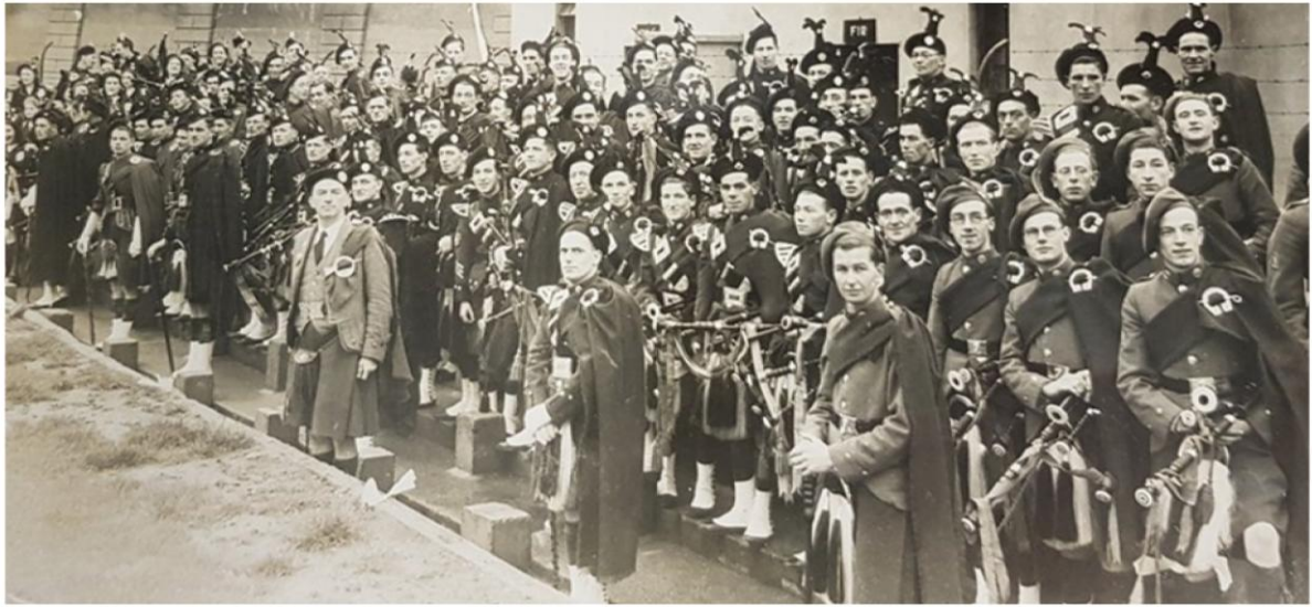
Oireachtas Pipe Band Display Croke Park possibly 1940