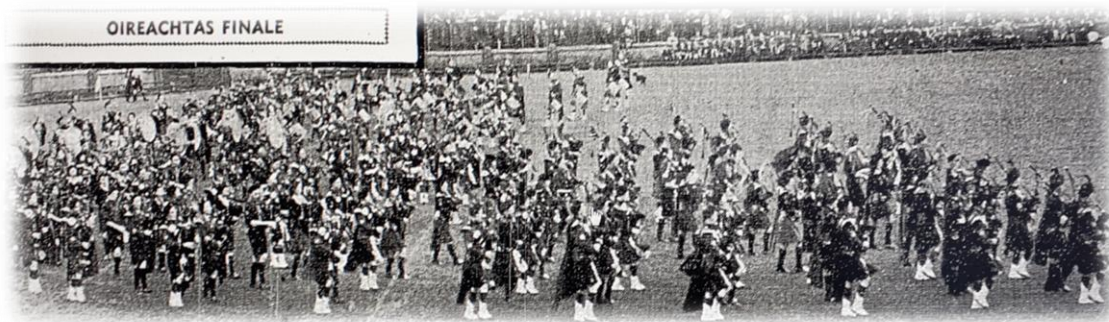
Massed bands at the Oireachtas display, usually held in the Autumn, which preceded a football match at Croke Park