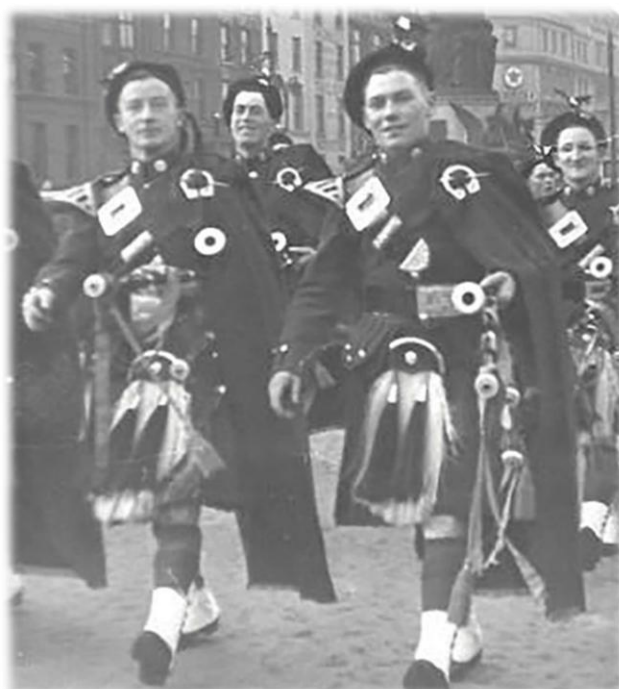
St Dominick's Pipe Band, Tallagh 1942

Information about pipe band activity is now difficult to glean as, during the Emergency, most 'daily' newspapers are confined to four pages, while the 'evening' broadsheets sometimes have only two pages. Most of the news therein is about the war.